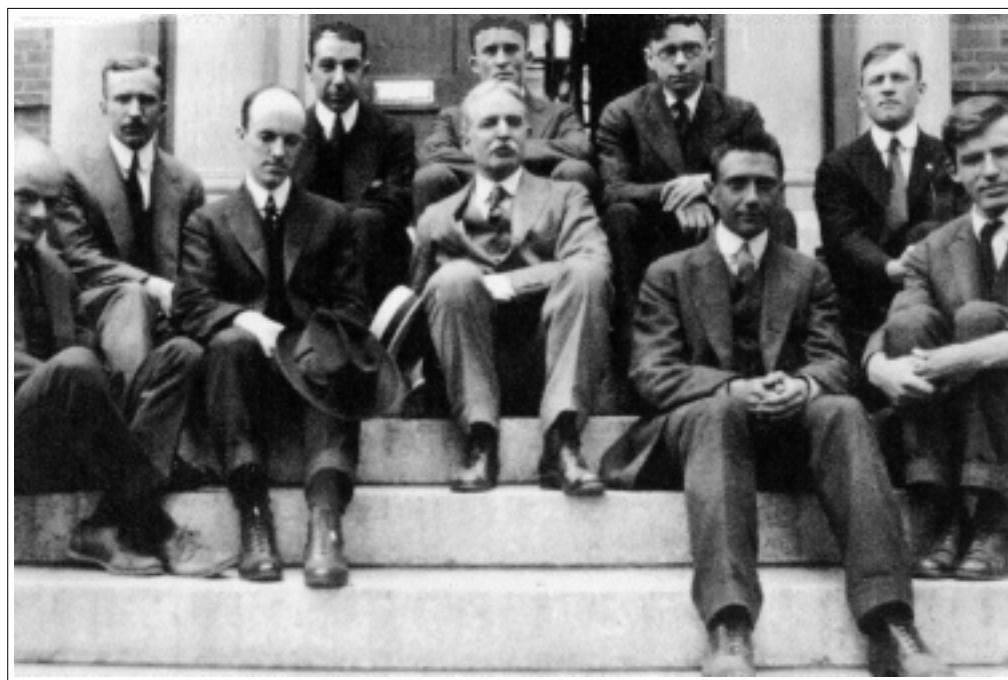
T. W. Richards with students and colleagues on the steps of Gibbs Hall; Conant in top row, second from right, ca 1921

street as the new laboratory. This year also coincided with the publication of the first edition of his undergraduate textbook, Organic Chemistry: A Brief Introduction , which went through several editions (41). A more detailed text, The Chemistry of Organic Compounds: a Year's Course in Organic Chemistry , was published in 1933. In 1931 Conant was appointed chairman of the chemistry department, a position that had also been held by his father-in-law T. W. Richards.